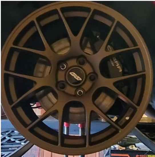
Apex 18x9.5 +35