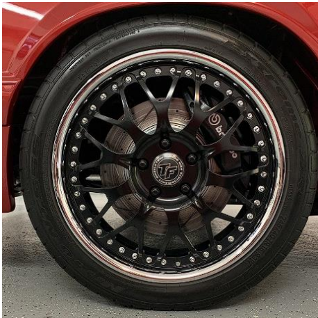
98 Cobra R 17x8