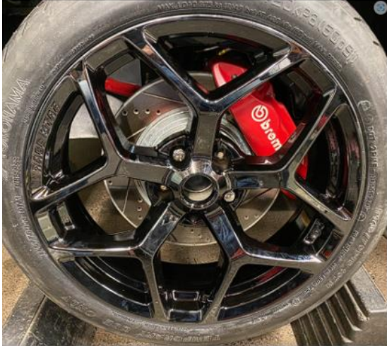
17x8 Enkie TS9 (3mm spacer)